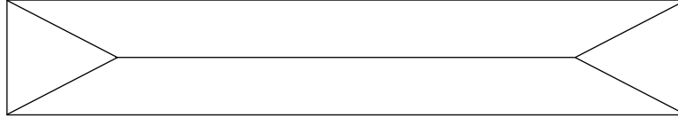
SCORE TILE AS SHOWN